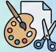
Art & crafts