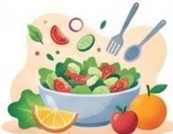
Healthy meal preps