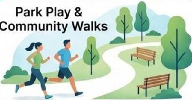
Park Play & Community Walks